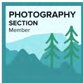
Photo Section Volunteers Needed

New: Photography Section Members now have a badge icon on their profile to indicate they are a paid member of the section, please check your profile when you have a chance. The icon looks like this: