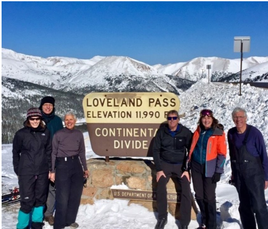
Bobcats: Mount Snikatu 11/9/18